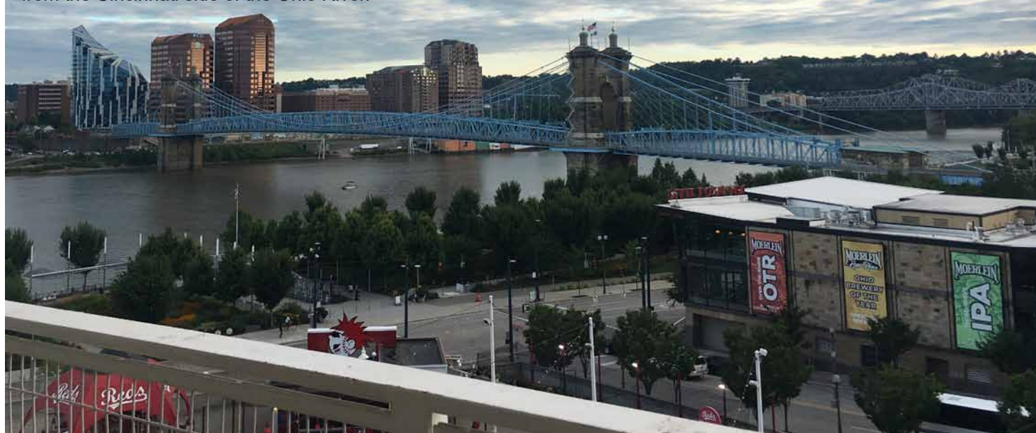
A view of Northern Kentucky and the John A. Roebling Suspension Bridge from the Cincinnati side of the Ohio River.