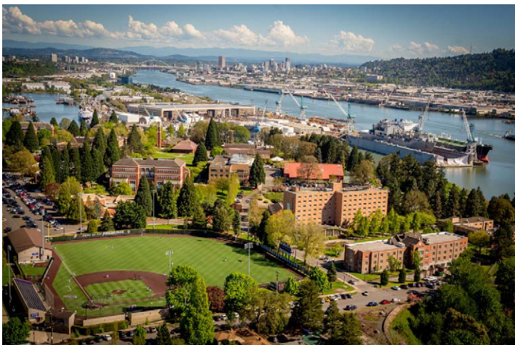
An aerial view of the University of Portland and the Willamette River.

Register now to join us for KGP's 44 th National Convention! June 21-23, 2019 University of Portland Portland, Oregon