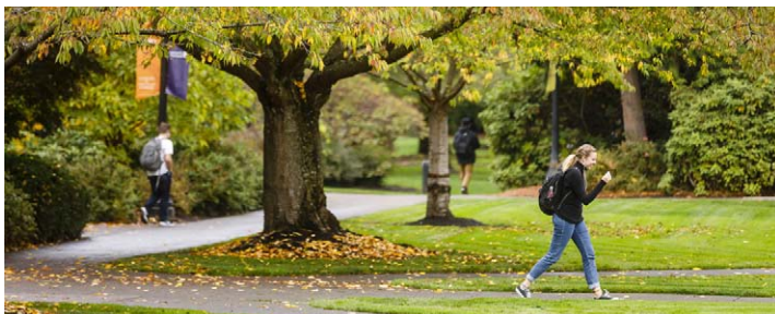
Join us at the University of Portland!

We have fully crossed over into 2019. Punxsutawney Phil emerged from his burrow to predict an early spring, the Super Bowl has come and gone, and summer is right around the corner. Okay, maybe I skipped over a few things, but I continue to be struck by just how quickly each calendar page turns over to the next. Life is a wonderful and fast-moving adventure if you ask me! Let's make the most of every opportunity we are given to impact our communities for the better as 2019 speeds along.