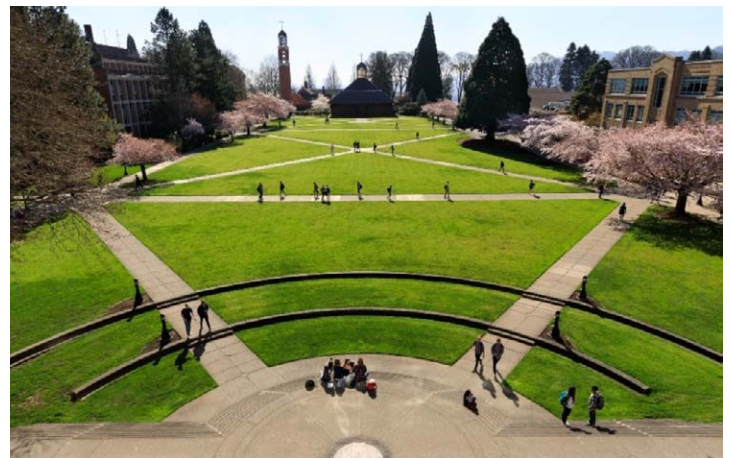
Cherry trees in blossom on the University of Portland campus.

Believing that education takes place both inside and outside the classroom, UP places a strong emphasis on residential living with 94 percent of freshmen and 57 percent of the total student body living in one of the University's 10 residence halls, including the newest,