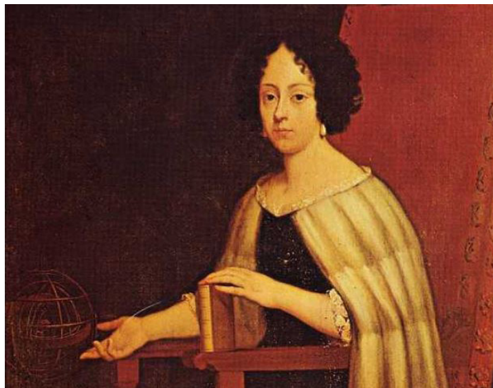
Elena Lucrezia Cornaro Piscopia