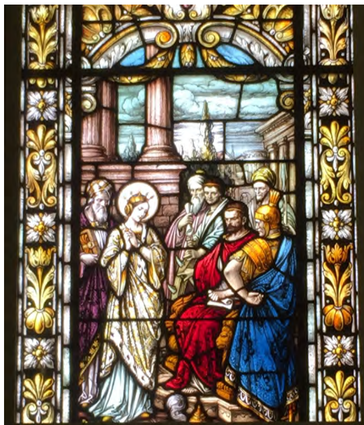
The stained glass window of Saint Catherine of Alexandria in Carlino Chapel at Chestnut Hill College

"Faith unto our holy God who rules us with a gentle rod, Service given with our love to honor Him Who reigns above. Saint Catherine strengthen us, unto your great spirit. Faith and service do we bring as humble gifts to Christ our King."