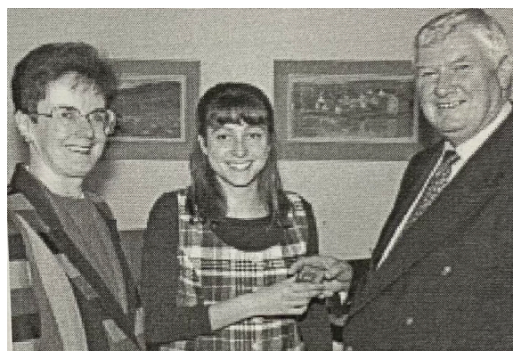
Medal Presentation St. Francis Xavier University Nova Scotia, Canada 1995

The recipient of the medal may be an undergraduate, graduate or nontraditional student. Recipients of this award are selected based on their leadership and service to the college or university as well as the ideals of a Catholic college education. KGP honor qualifications are not required for this award.