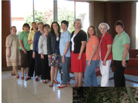
(Above): Kappas wearing red shoes in Kansas City at the 2008 National Board Meeting.

The "KGP 80th Anniversary Booklet" was published during my presidency in 2006. It was enlightening to